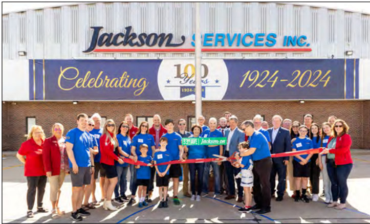
Jackson Services, Inc. - 100th Anniversary 981 33rd Ave, Columbus, NE | (402) 564-2824 www.jackson-services.com