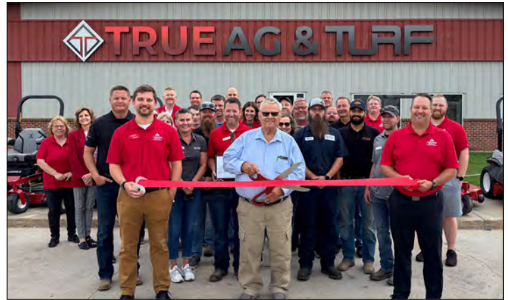
True Ag & Turf - Ribbon Cutting 2526 E 23rd St, Columbus, NE | (402) 564-3289 www.trueagturf.com