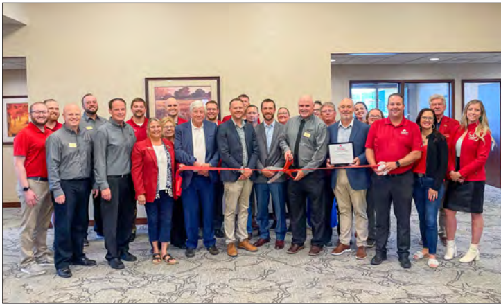
Pinnacle Bank - 25th Anniversary 210 E 23rd St, Columbus, NE | (402) 562-8936 www.pinnbank.com