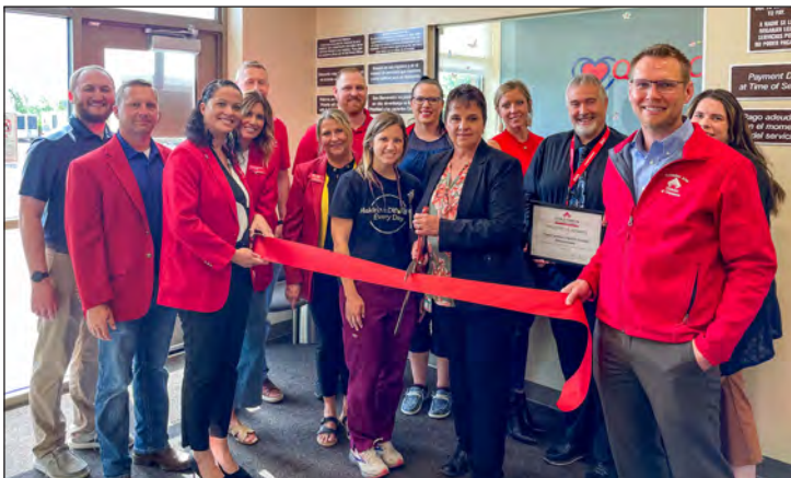
East Central District Health Department (Quick Care Clinic) - Ribbon Cutting 4321 41st Ave, Columbus, NE | (402) 562-7500 www.ecdhd.ne.gov