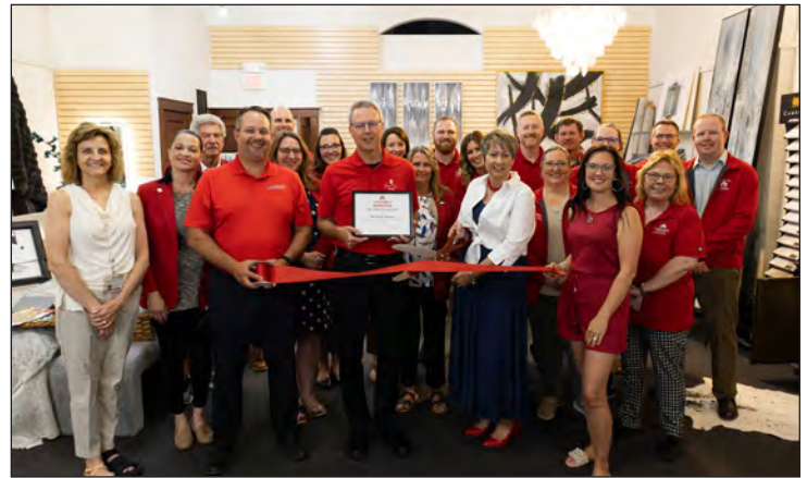
Red Door Designs - Ribbon Cutting 2511 13th St, Columbus, NE | (402) 276-1808 www.reddoorstylist.com